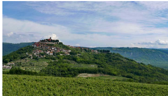
Approaching the walled city of Motovun