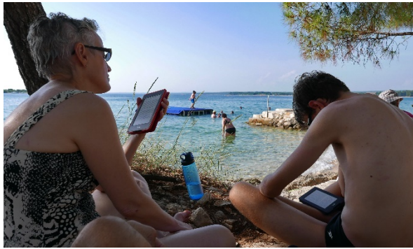
Another beautiful campground on the coast