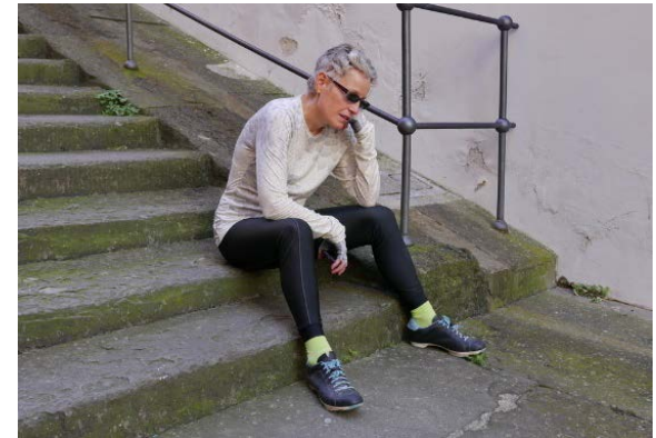
A long, hot, hilly day to get into Trieste