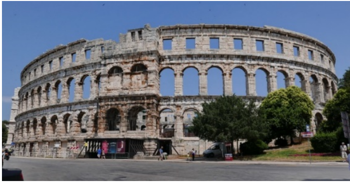
The Pula Arena - Roman amphitheater