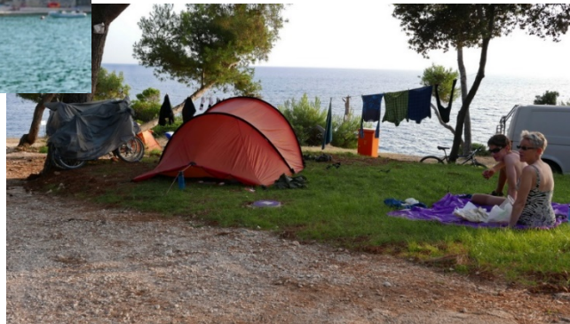
Campsite on the coast in Pula