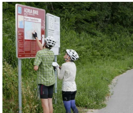
Well signed bike path in Slovenia