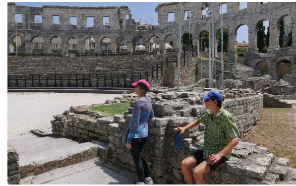
About to head to underground museum