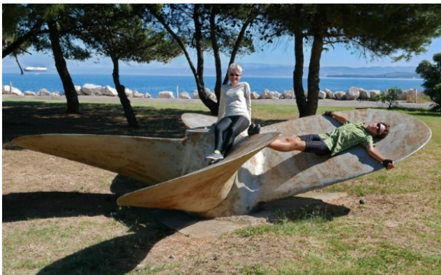
A huge propeller at a shipyard in Izola