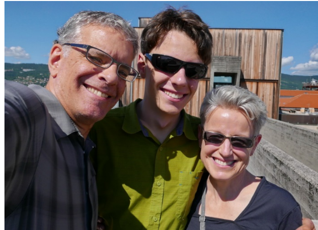
On the roof of the Museo Revoltella in Trieste

We started in Trieste, Italy, rode south thru Slovenia, headed east to Motovun, then continued south along the Istrian coast. Our intent had been to get to the islands south of the peninsula, but the limited selection of roads and the steepening terrain stopped us at Duga Uvala on the east side of the peninsula. We backtracked back north, zig-zagging along the coast for our return to Trieste.