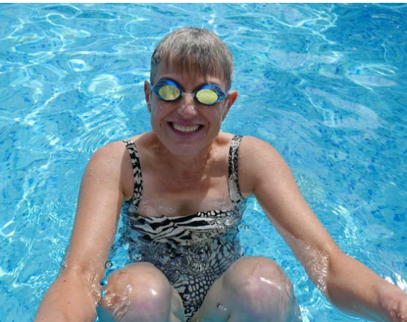
Camping Ulika in Rovinj had a lovely pool