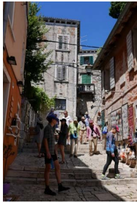
Walking the narrow streets of Rovinj