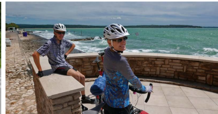
A stop along the coast in Novigrad, Croatia