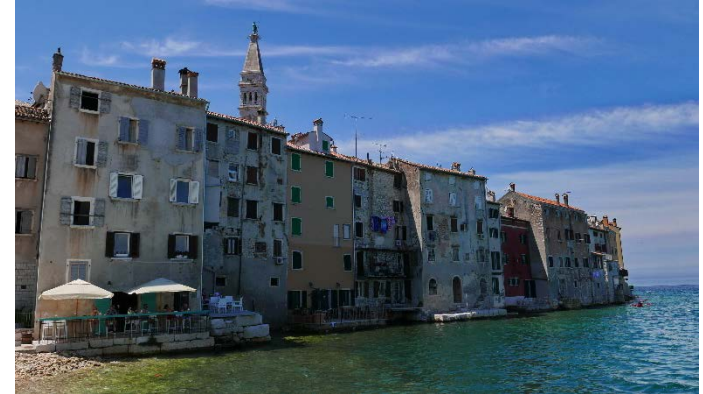
Wall of buildings rings Rovinj