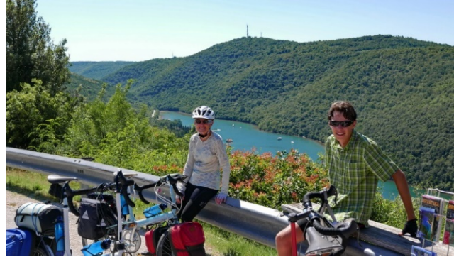
View down to the Lim canal