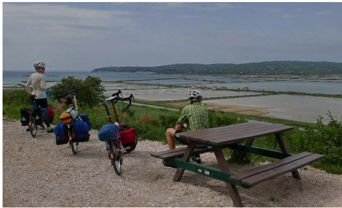
Salt lagoons near Basanija