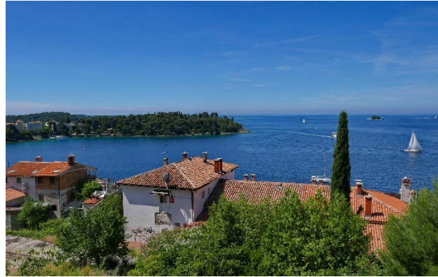
Nice view of Adriatic from Rovinj