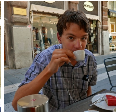
Enjoying his first espresso