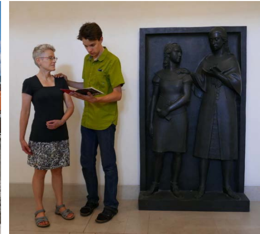
A pair of posers