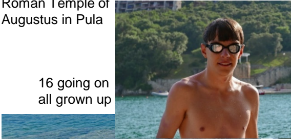
16 going on all grown up