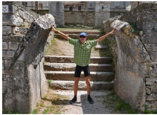
Bridging arch at the Pula Arena