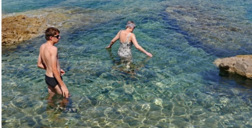
Super clear water at coast around Pula