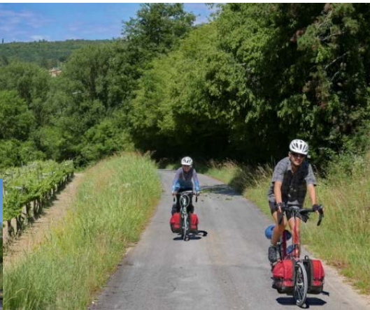
A beautiful farmers road starting in Dragonja Slovenia made for a perfect day of riding