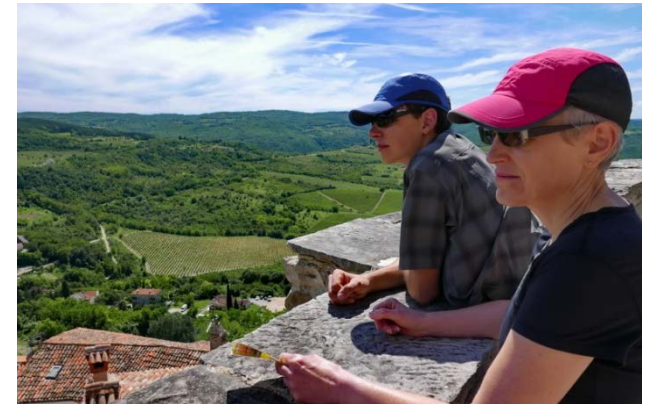
View from hilltop walled city of Motovun