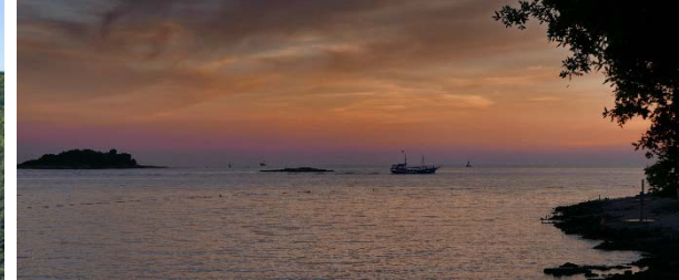
Sunset at Kamp Porto Sole near Vrsar