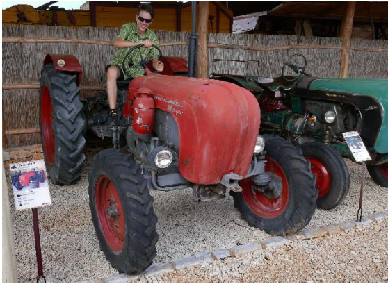
A Porsche L319 tractor from 1962 at the Traktor Story in Nova Vas