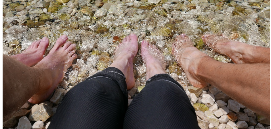
Cooling off our feet as the temperature climbs into the 90's