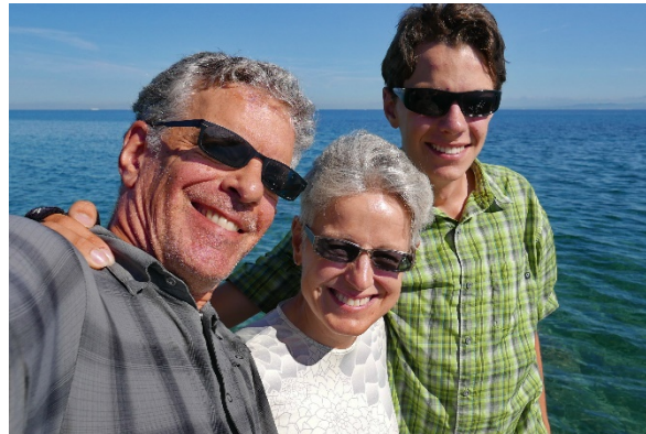
A last photo along the coast