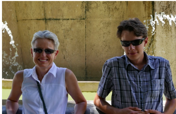
Resting at the Castle of San Giusto