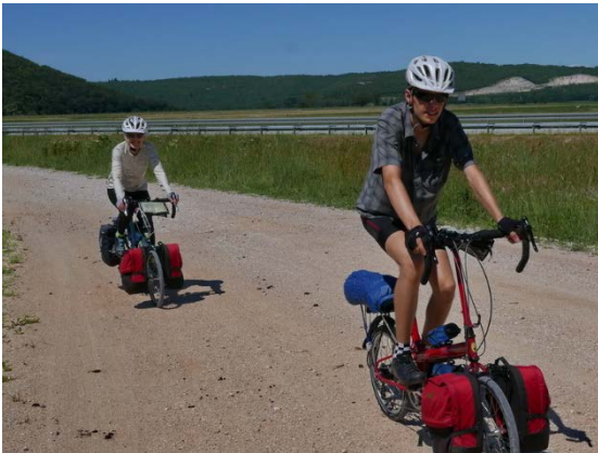
Miles of gravel roadway east from the coast