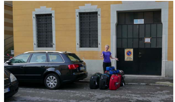
Ready for the taxi to the airport