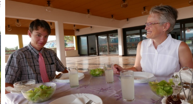
Wearing his Croatian tie to dinner in Duga Uvala