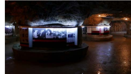
Support column in the underground shelter tunnels of Pula