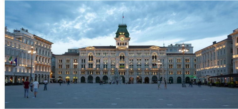
Trieste's City Hall and Piazza Unita d'Italia

Our second tour on our Bike Friday folding bikes found us in Croatia. Except for one super-harrowing ride in torrential rain up a twisting gorge road, the weather was splendid - mostly warm and sunny. The Istrian coast was uniformly beautiful, with most campgrounds located at inlets providing spectacular sunset views. Most roads were in great shape, though we were surprised to be forced onto several gravel roads that our maps indicated as paved.