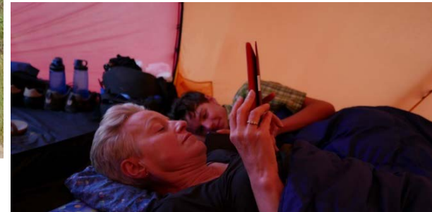
Some reading before bedtime