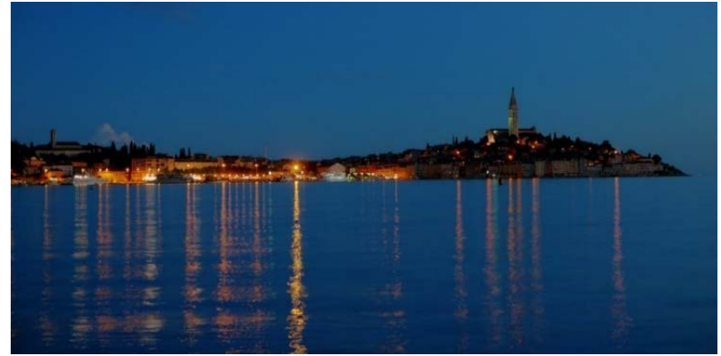
Dusk view of port city of Rovinj