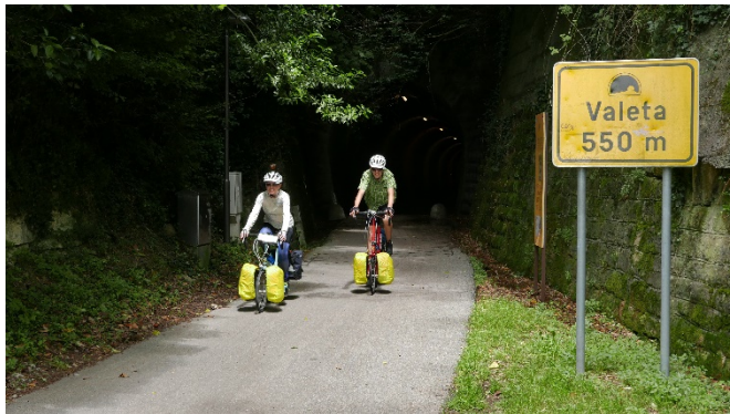
No lights needed for short tunnels