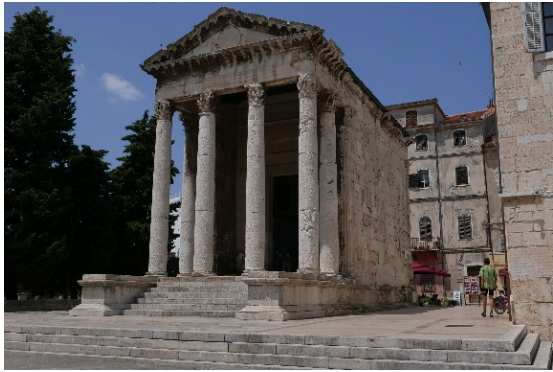
Roman Temple of Augustus in Pula