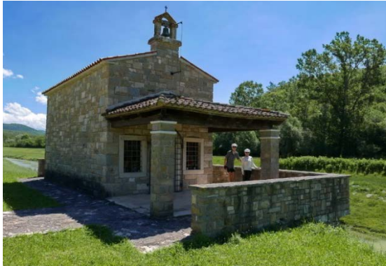
Church of Our Lady of Bastije along the Mirna Canal