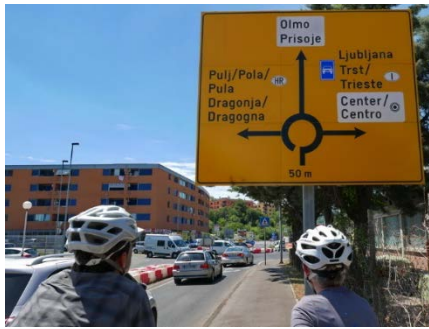
Heading back to Trieste