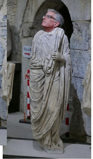
Each of us took a turn to be an ancient Roman