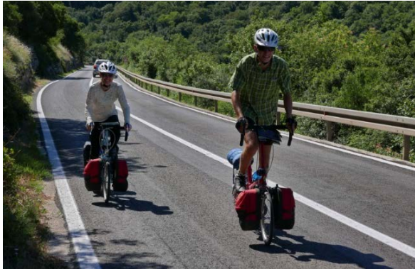
Long, twisty climb around the Lim estuary