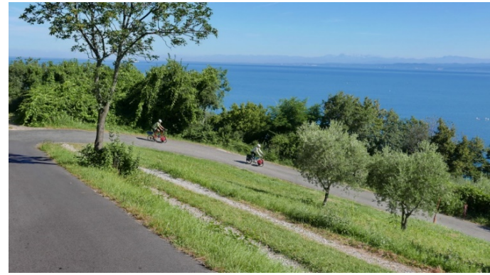
Steep road from campground to ride along the coast