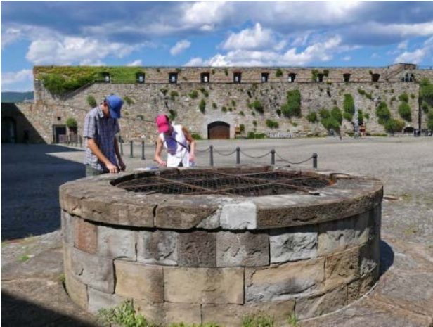
Checking out the cistern at the Castle of San Giusto in Trieste