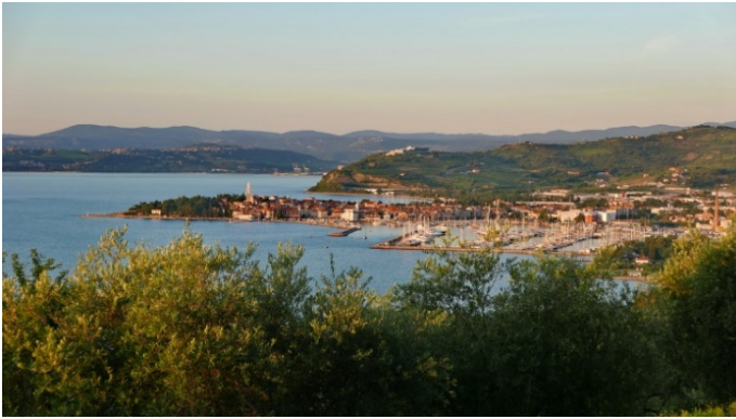
View looking north to Izola, Slovenia