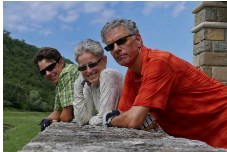
Rest stop along the Mirna Canal