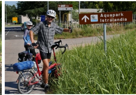
Aquapark signs were all over the Istrian peninsula