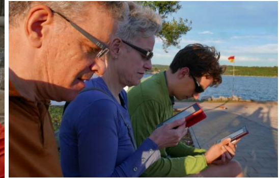
Reading with a view of the Adriatic at Aminess Sirena Camping in Novigrad