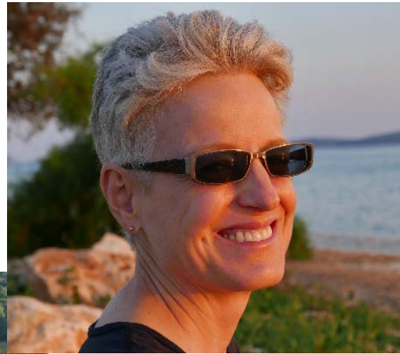
Bask in her glow