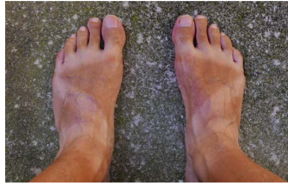
Kevin's feet after a successful vacation