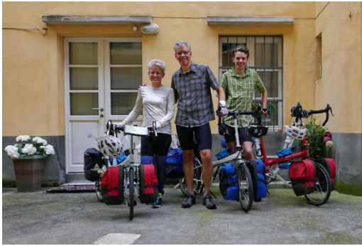
Starting off from the Airbnb in Trieste