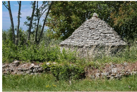
A round dry stacked stone Kozun with conical roof near Pula