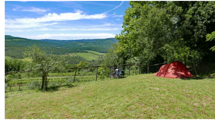
Hardly any level ground at Motovun Camping