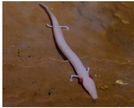
Blind aquatic salamander at Jama-Grotta Baredine