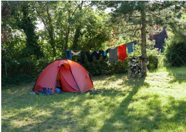
Belvedere Camping just before Trieste