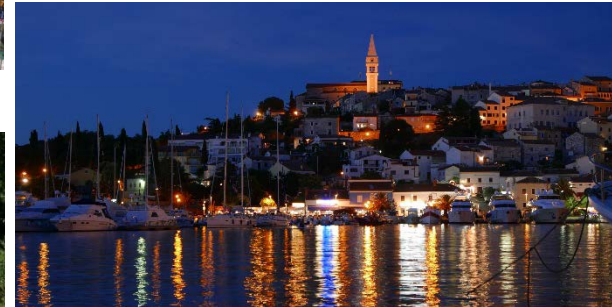
Tourist town of Vrsar at night