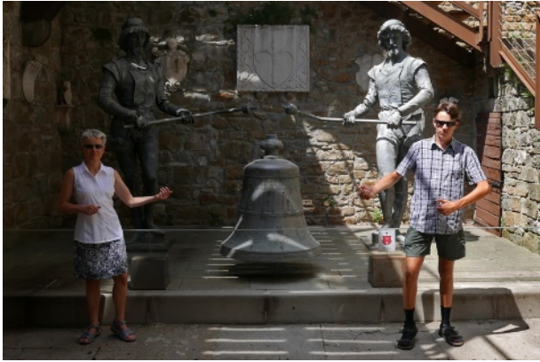
The original figures from the clock tower of Town Hall in Trieste