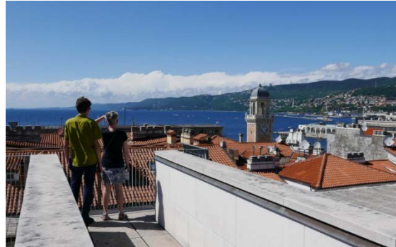
View of Trieste's port from Museo Revoltella